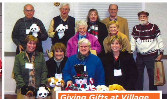
Giving Gifts at Village Christmas