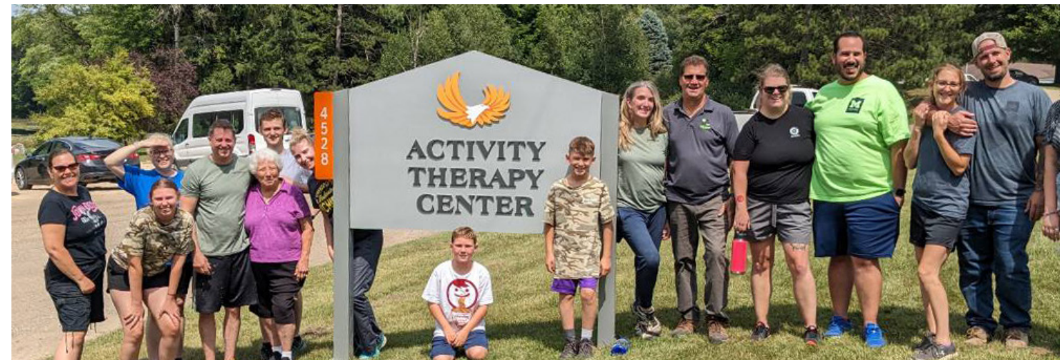
Grumlaw Church attending Serve Saturday