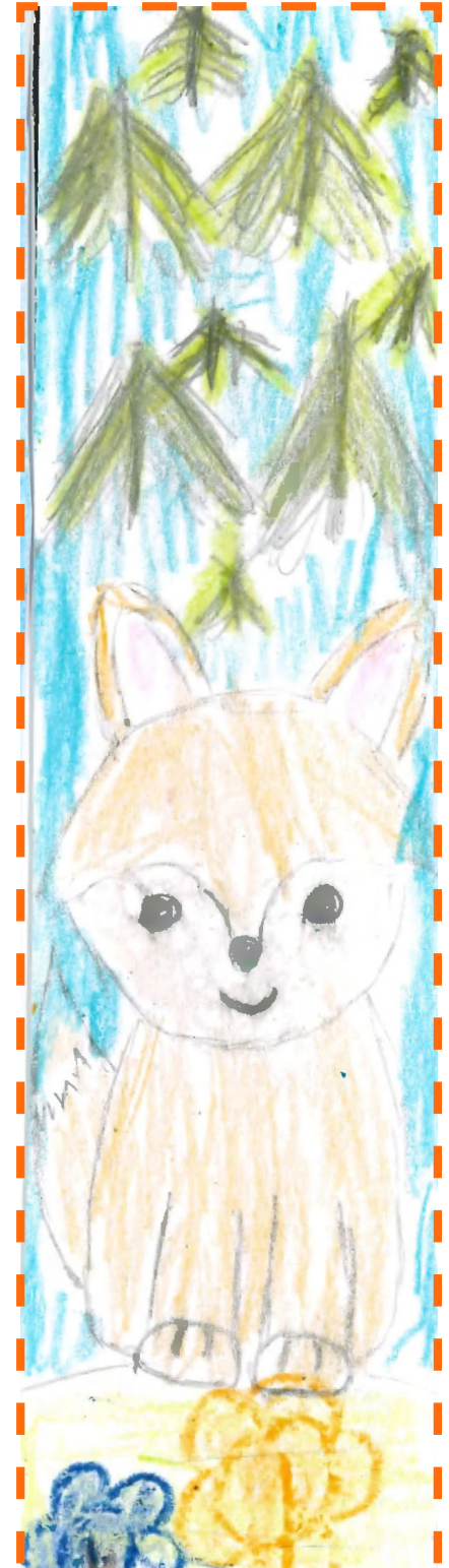
ARTWORK CREATED BY EAGLE VILLAGE YOUTH

One of the youth described Picture Day as a truly wonderful experience, as they had never been able to participate in school picture days before. "It was not important to my family to have a photo of me," he said. "It was cool that I could pick the photos and backgrounds that I wanted for myself. These are for me, these are now my moments that I want to remember!"