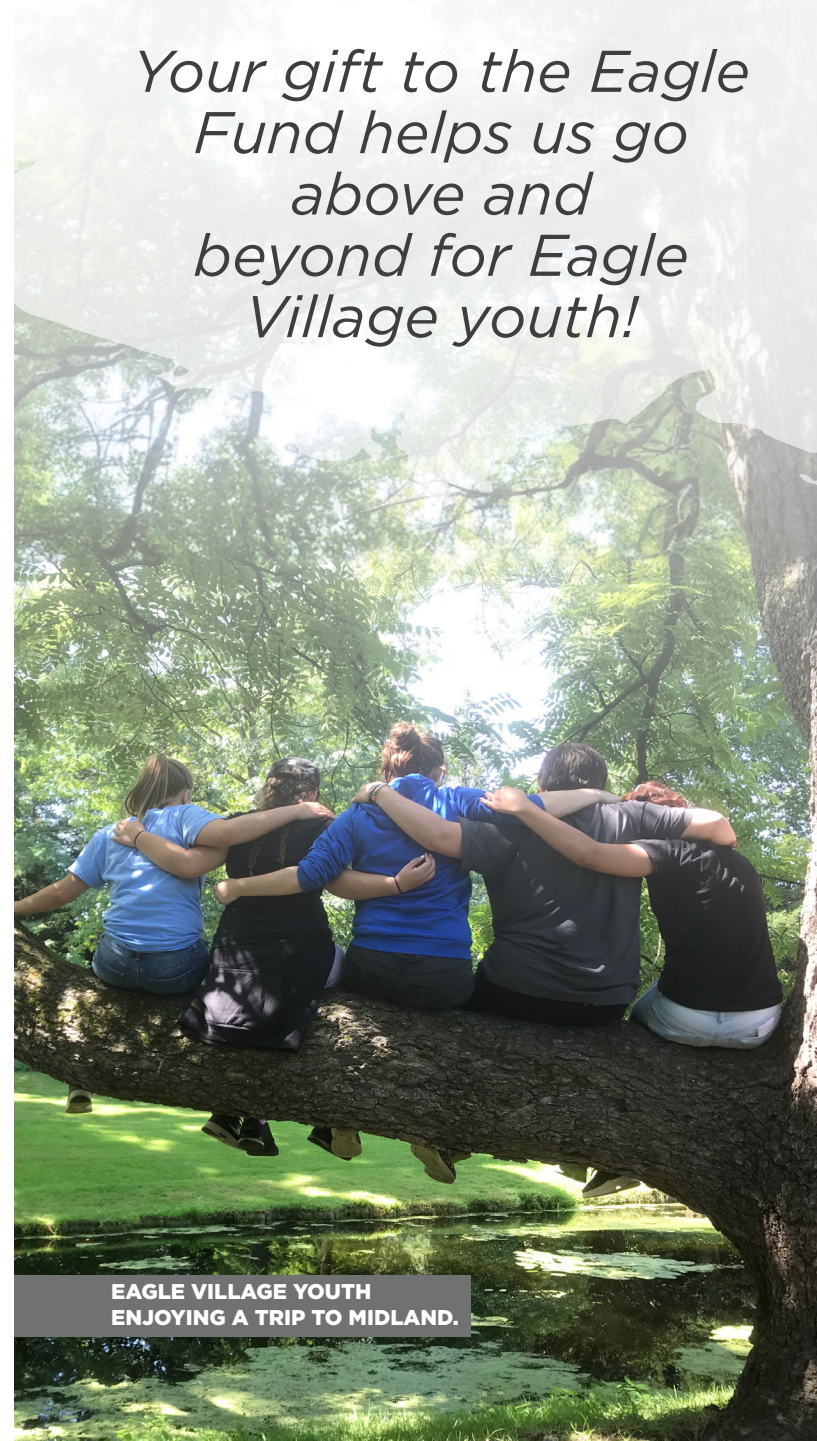
EAGLE VILLAGE YOUTH ENJOYING A TRIP TO MIDLAND.

Your gift to the Eagle Fund helps us go above and beyond for Eagle Village youth!