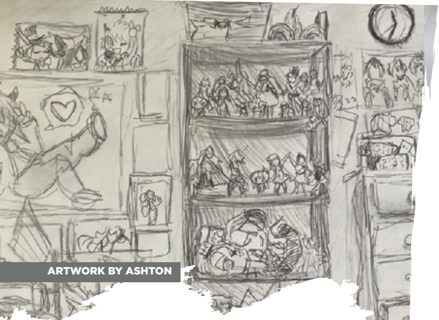
ARTWORK BY ASHTON